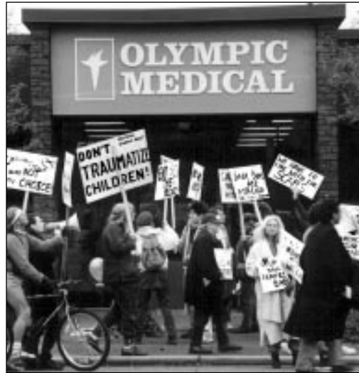
Marchers picket Circumstraint building.

SEATTLE, November 11 – Activists marched behind the NOHARMM banner to Olympic Medical, manufacturer of the Circumstraint, advertised as the circumcision board that “can immobilize the struggling infant securely in the correct position...encircle the infant’s elbows and knees, depriving him of leverage and [holding him] securely without danger of escape.”