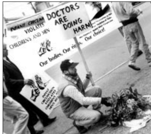
Infant rights activists place flowers – not a baby – upon Circumstraint.