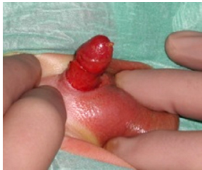
Excision of all penile skin during circumcision

"Our survey findings indicate that most physicians performing neonatal circumcisions in our community have received informal and unstructured training. This lack of formal instruction may explain the complications and unsatisfactory results witnessed in our pediatric urology practice. Many practitioners are not aware of the contraindications to neonatal cir-